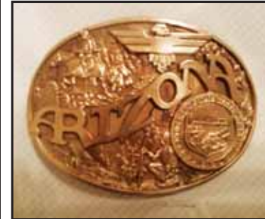
What a great door prize for this event!

A standing ovation for this band! The best tribute to Brooks and Dunn right here at Farnsworth Hall. Lots of dancing to “Neon Moon” and “Boot Scootin' Boogie,” but “My Maria” captures your heart every time! Absolutely the friendliest and most well organized group ever. I hope you had your picture taken with