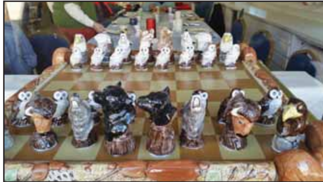
Amazing wilderness Chess set for sale