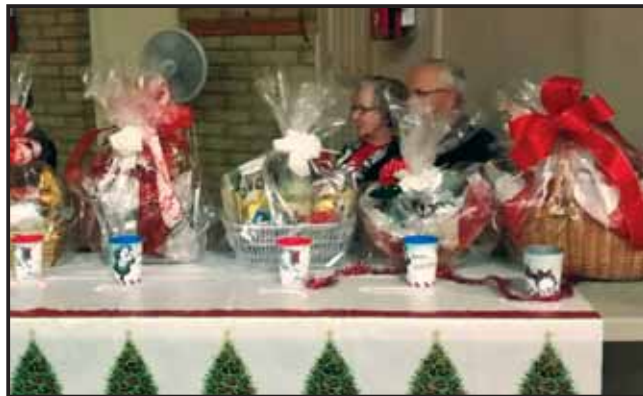
Lots of goodies for the Basket Raffle!