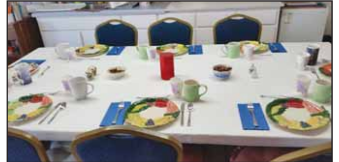
The plates of many colors