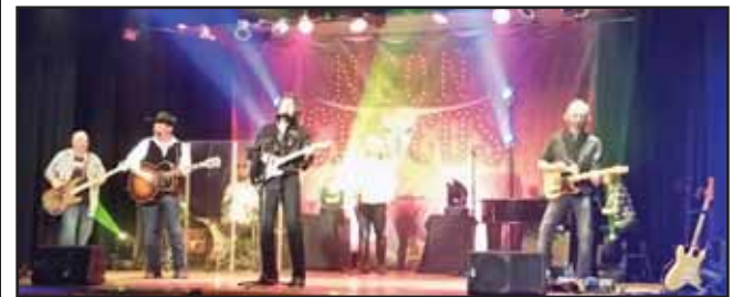
Neon Circus Tribute to Brooks and Dunn

We are looking forward to our Super Bowl party on February 7 and the Valentine's Day Luncheon on February 13.