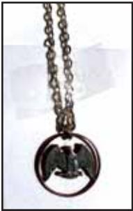
A unique door prize given