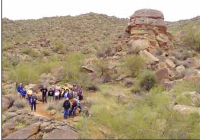
Hikers by Storm Trooper Rock and Twisted Sister Trail Sign

Are you interested in joining our hiking group? We are not a club so there are no dues. But there are some requirements: First and foremost is to be in good hiking shape. Our trails are between four and six miles long, sometimes up and over