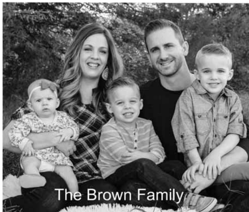
The Brown Family

Family Owned and Operated -Senior and Military Discounts