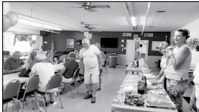
Ice Cream Social Crowd

Thank you to everyone who made this event possible, and thanks to all who attended and made it such a fun celebration! See you at the Dogs 'N Suds Party on August 6 at 5:00 PM in Read Hall (music by "We Just Duet").