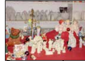
Greenware and finished Christmas pieces for sale

As a reminder, classes meet on Tuesdays and Thursdays from 9:00 AM - 12:00 Noon at the Read Hall location in the ceramics studio located on the west end of the building. All skill levels from beginner to experts are welcome.