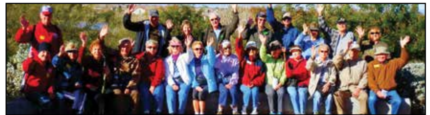
Dreamland Desert Walkers at Chandler Veterans' Oasis Park - what a colorful bunch!

If you are interested in learning more about the walking group, please look at the photos and information at www.dreamlandvilla.org . Click on Clubs and Activities, then Outdoor Activities, and then Dreamland Desert Walkers. You will see a schedule of walks and learn what the group did last winter, along with many photos of each walk. The October Citizen will have information on walking events for the upcoming 2015-2016 winter months. See you on the happy easy trails of Arizona!