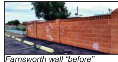
Farnsworth wall "before"