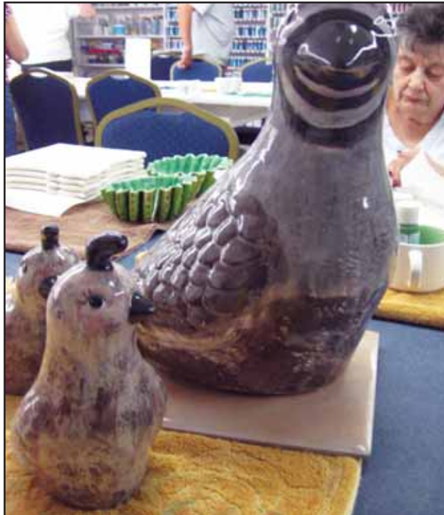
Finished pieces just taken out of the kiln

Please feel free to drop by during class hours to check out the sale items, do some shopping, or to just say "Hi." We look forward to meeting new members and making new friends.