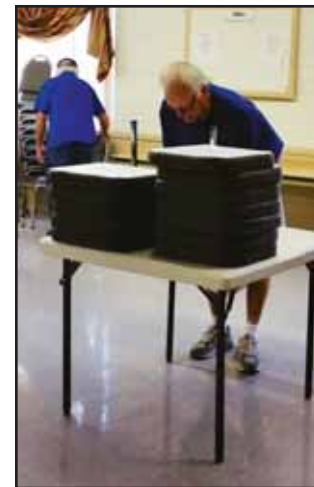
Workers replacing seats

to the Fundraiser Committee Account. Your support is so