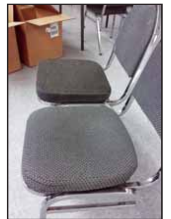
Read Hall chair seats - before and after

appreciated! (Remember, donations to DVCC are NOT tax deductible.)