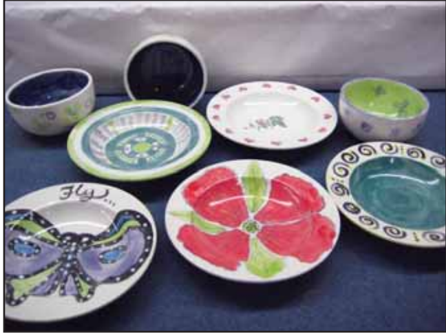
"Bowls for the Hungry," painted by Fun Time Ceramics artists