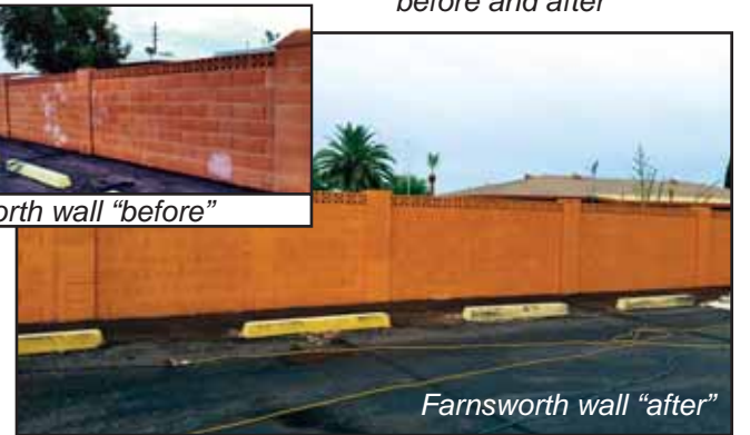
Farnsworth wall "after"