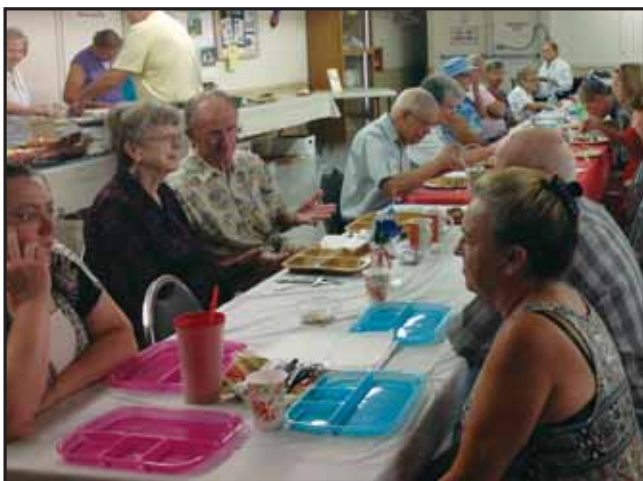
What a great turnout!

These past months have given us an opportunity to meet more of our neighbors, learn more about what brought you to DVCC and share stories of our kids and grandkids. We are so grateful to have had these moments with everyone.