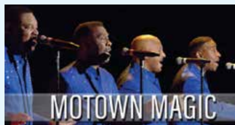
MOTOWN MAGIC / Saturday, Feb. 23