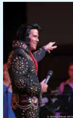
CHRISTMAS SHOW Saturday Dec. 15, 2018