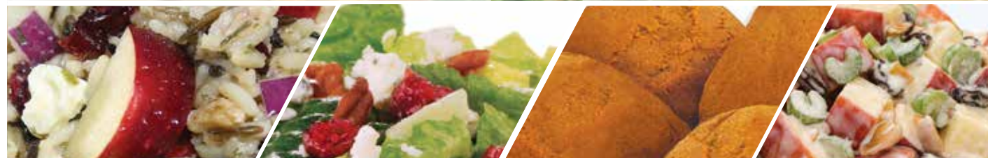
Wild Rice, Cranberry, & Apple Salad