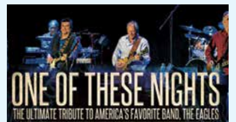
THE EAGLES / Friday, March 15, 2019