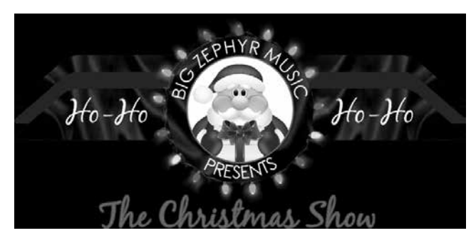
Sunday, Dec. 13th Christmas Show featuring The Big Zephyr

"Stay Tuned" for many more upcoming events! We'll be coming back STRONG! Thank you for all of your support.