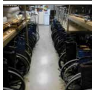
Knee walkers and wheelchairs, only a small portion of what's available at Help Services.