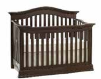
We still have those really nice Munire Cribs for sale, both in very, very good condition.