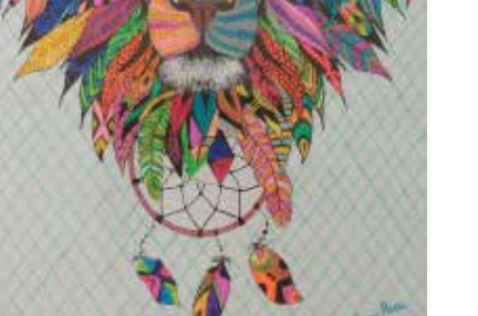
Gel Pen Painting