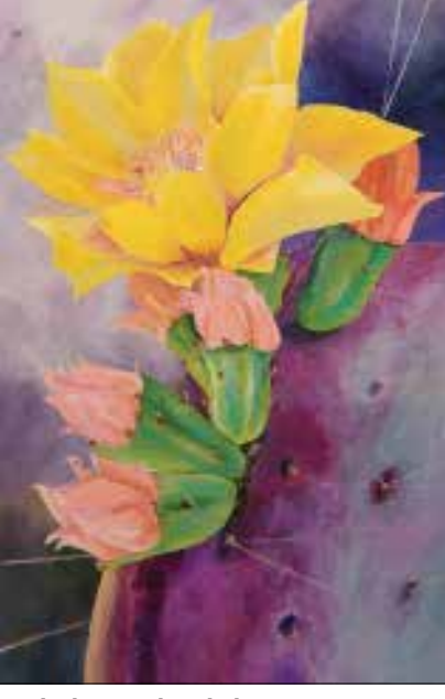
Beginning Acrylic Painting