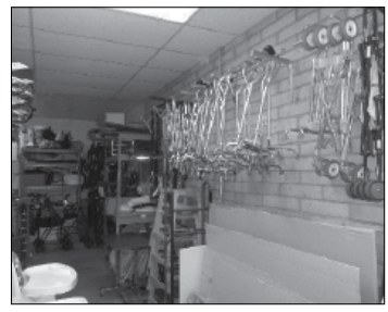
A view of our row of canes and more.