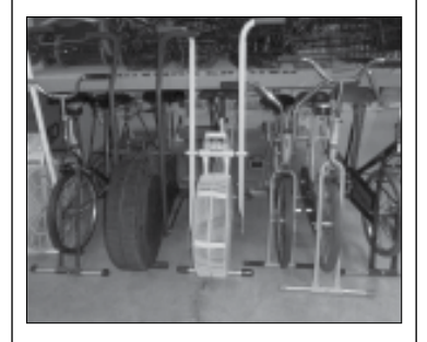
This is what's available in our exercise bicycle department

Monday, Wednesday and Friday from 9:00 am to noon.